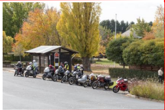
It's a great ride and lots of good company