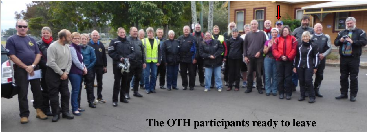
The OTH participants ready to leave