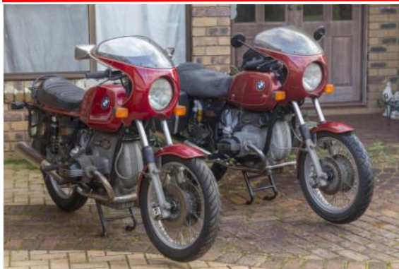
2 more of Dieter's photos of the OTH run.

Happy searching and reading, Ed/Librarian